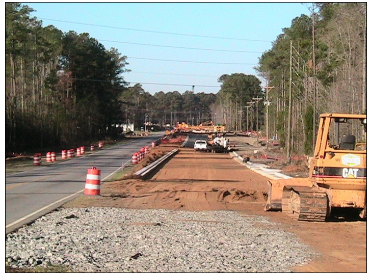
Camden Road is being widened from Hope Mills Road to the Hope Mills Bypass.