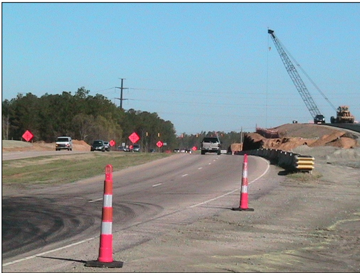
Work on Murchison Road includes widening to six lanes from the Outer Loop to Honeycutt Road.